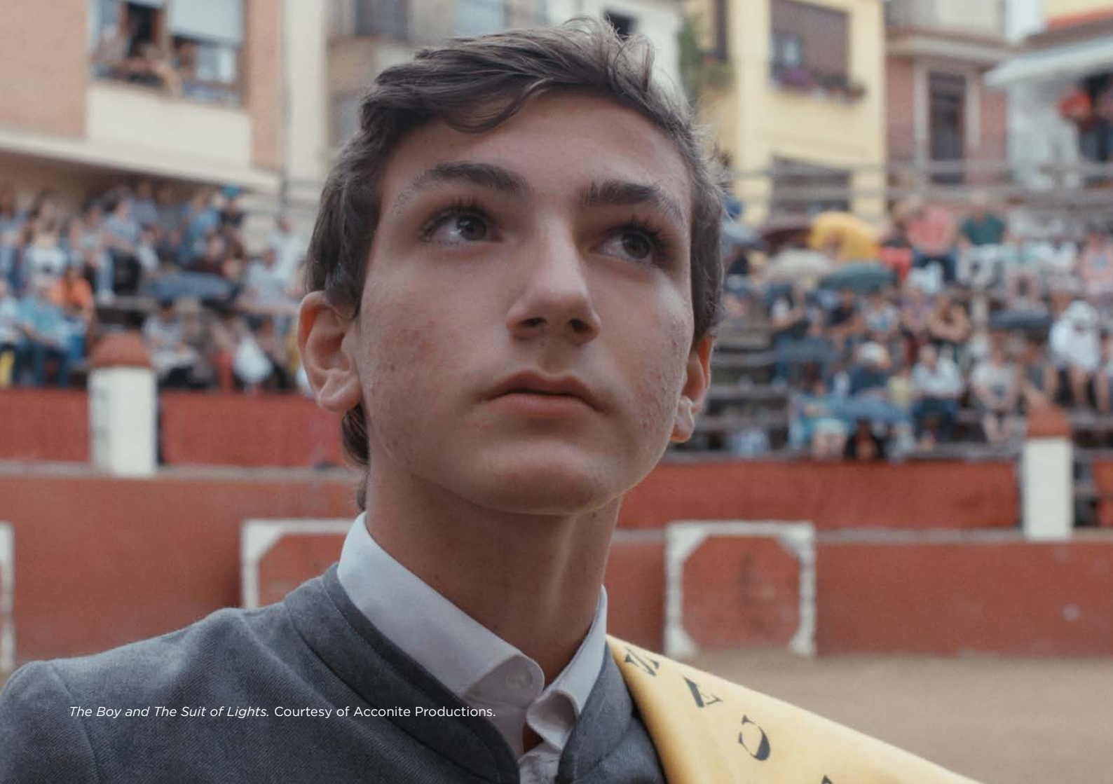
The Boy and The Suit of Lights.