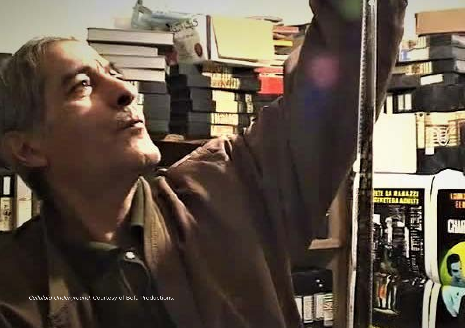
Celluloid Underground.