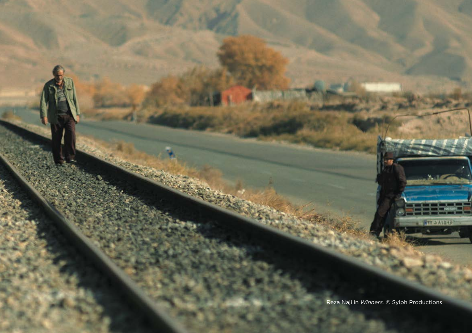
Reza Naji in Winners .