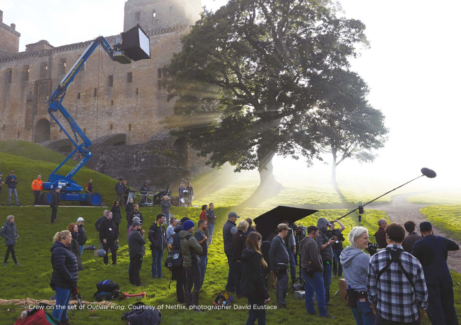
Crew on the set of Outlaw King .