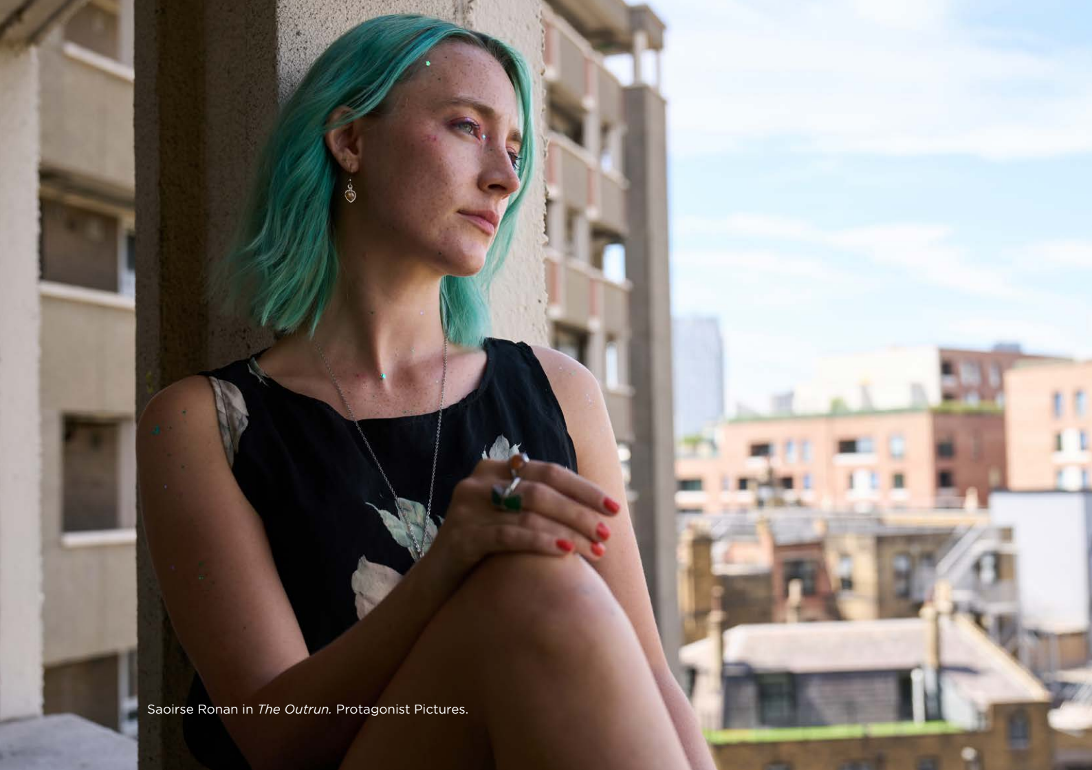
Saoirse Ronan in The Outrun .