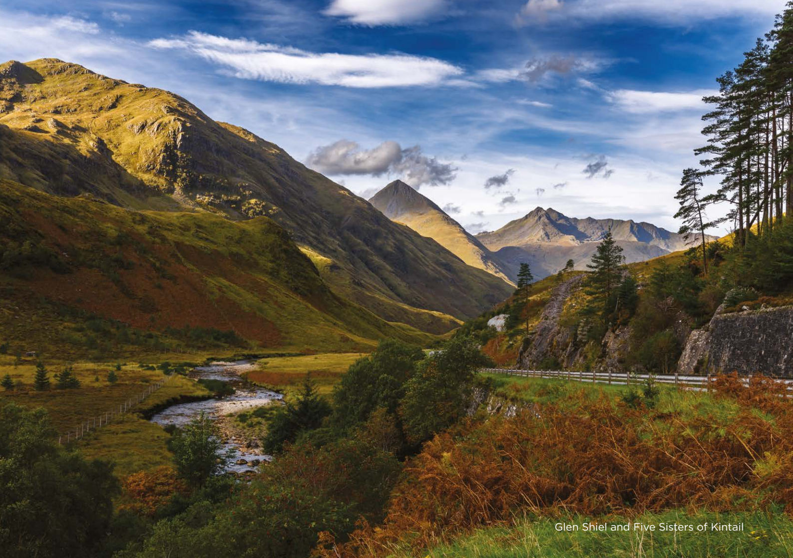
Glen Shiel and Five Sisters of Kintail