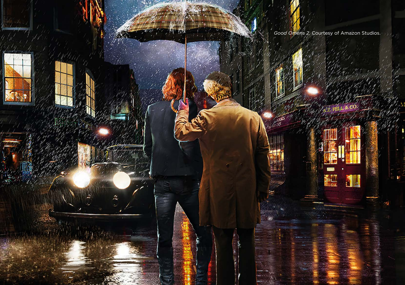
Good Omens 2.