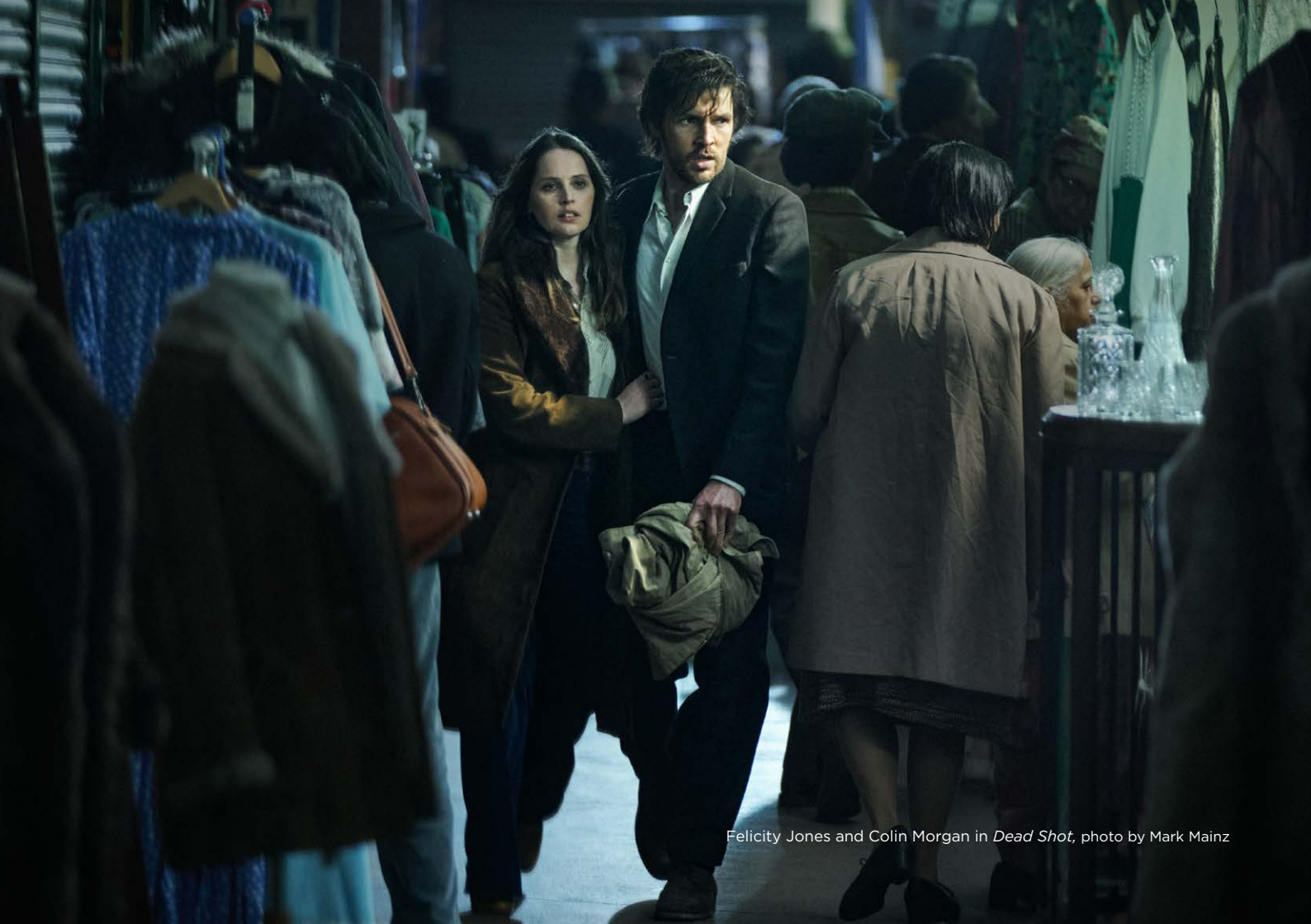
Felicity Jones and Colin Morgan in Dead Shot