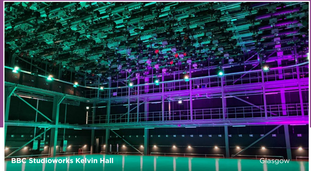
BBC Studioworks Kelvin Hall