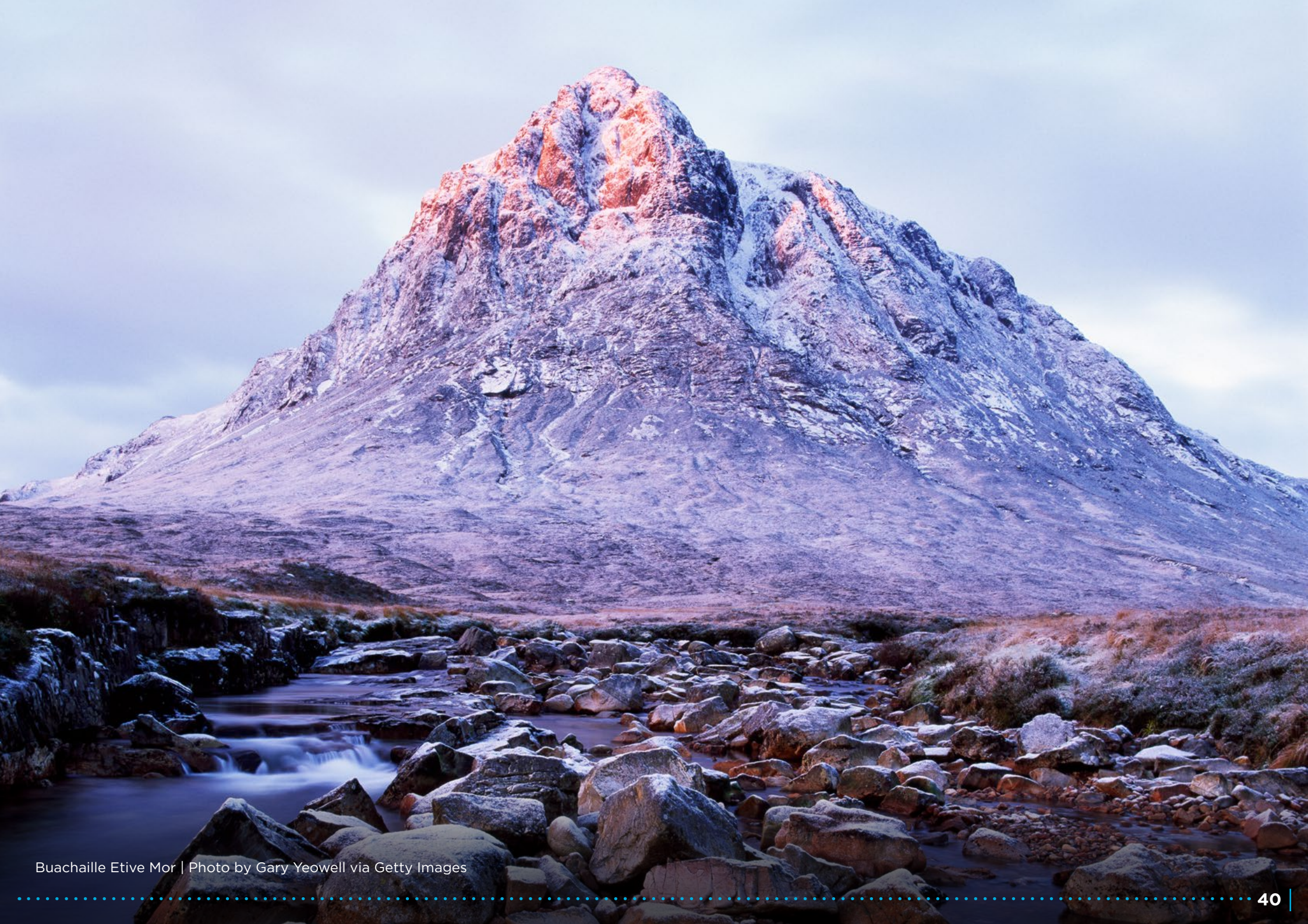
Buachaille Etive Mor