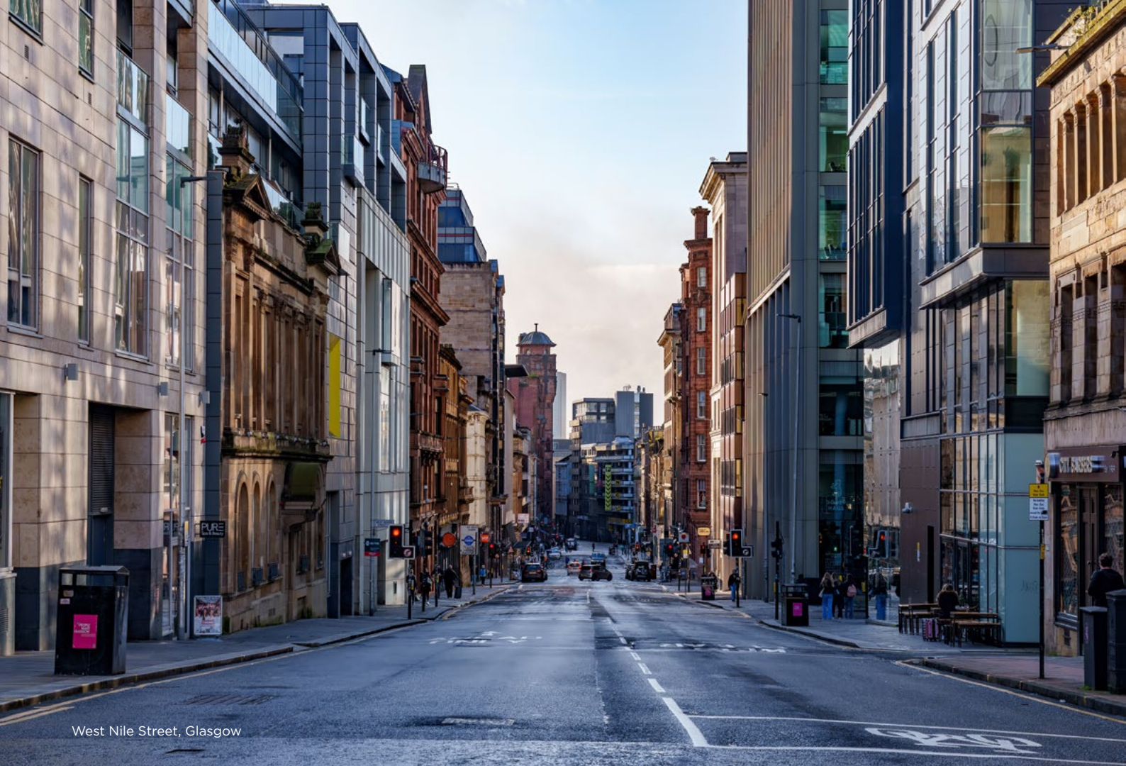
West Nile Street. Glasgow