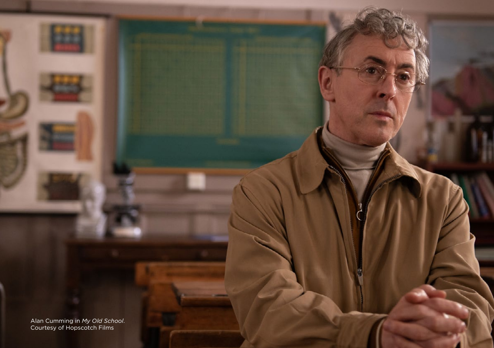
Alan Cumming in My Old School . Courtesy of Hopscotch Films