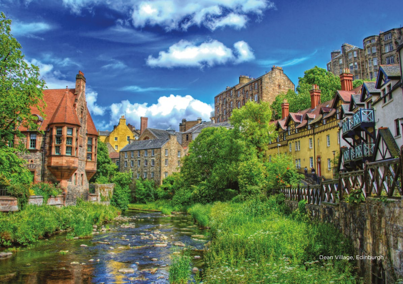
Dean Village, Edinburgh