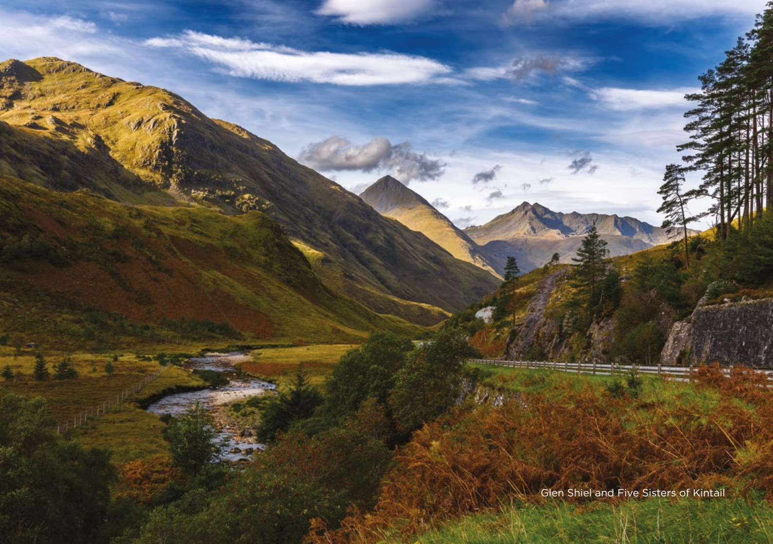
Glen Shiel and Five Sisters of Kintail