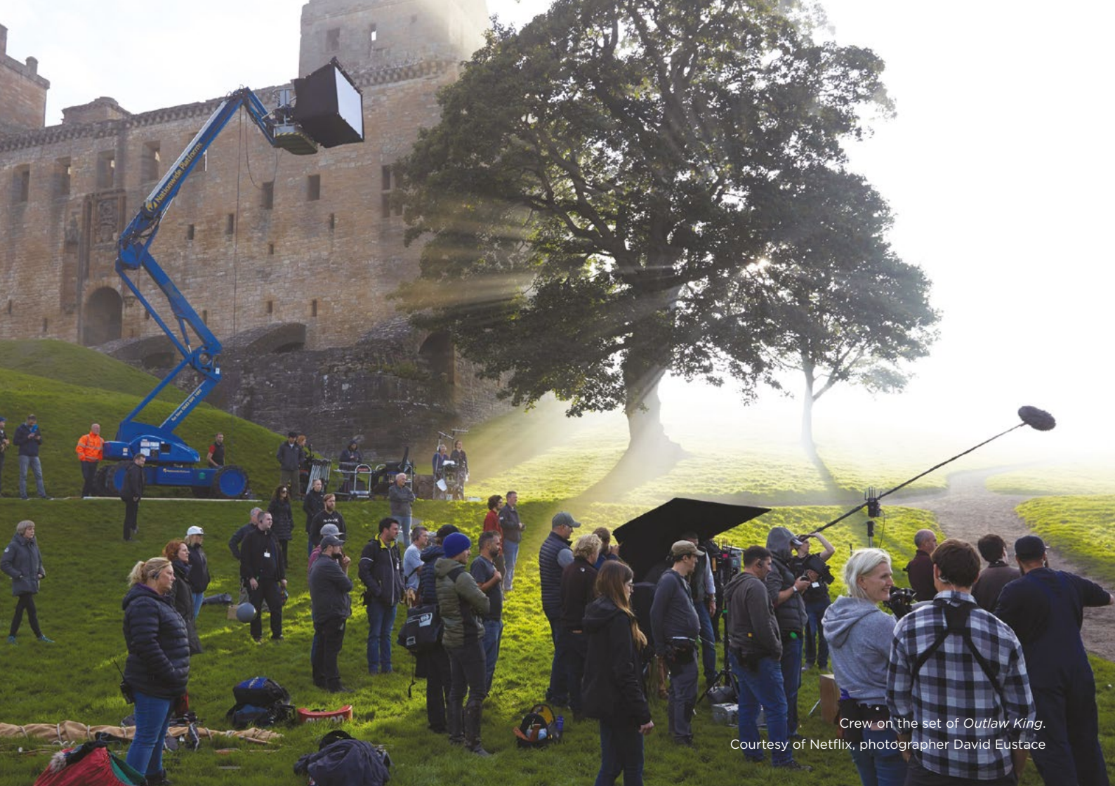
Crew on the set of Outlaw King .