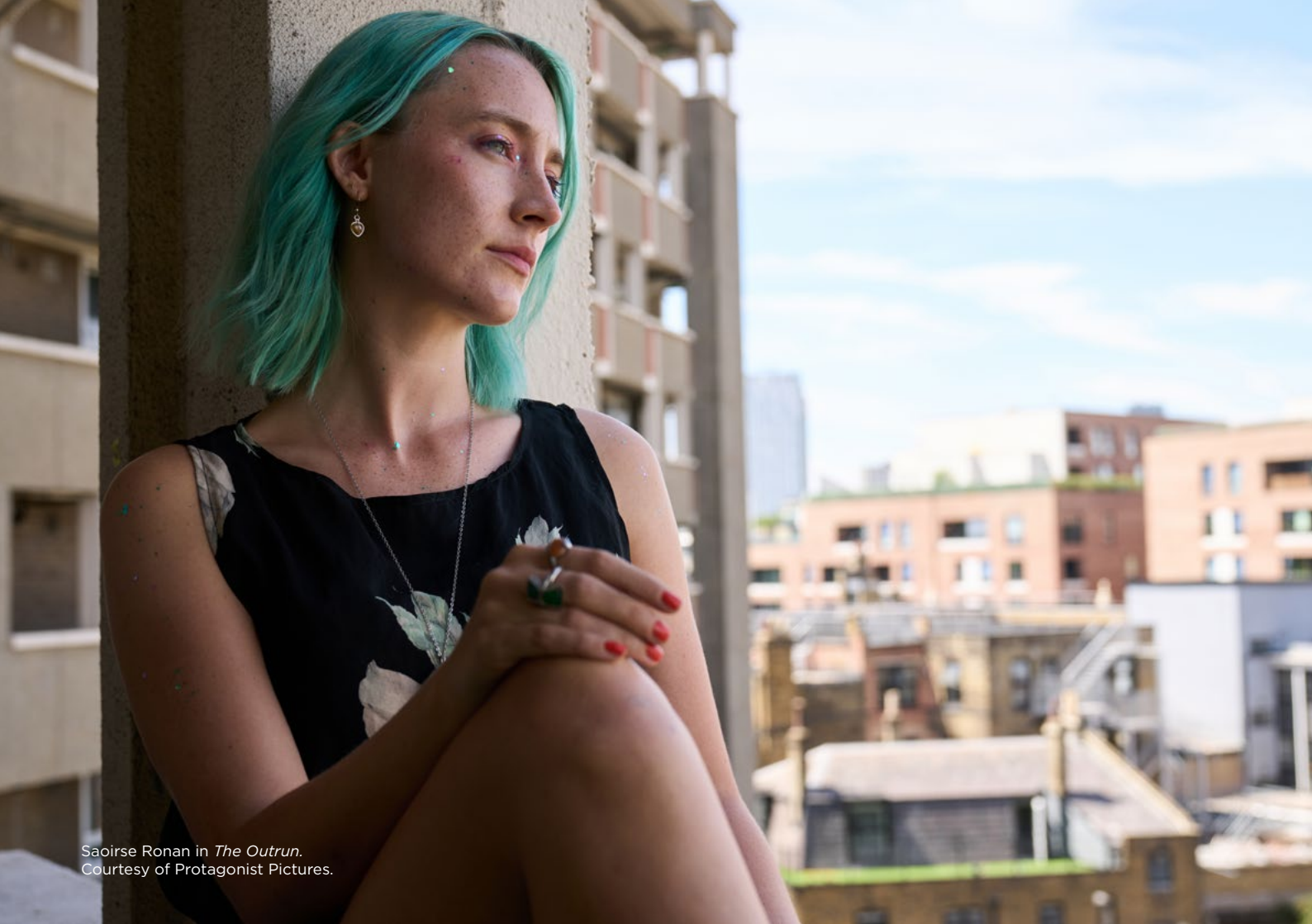
Saoirse Ronan in The Outrun .