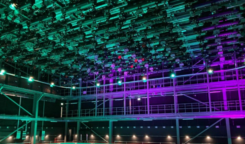
Studioworks Kelvin Hall