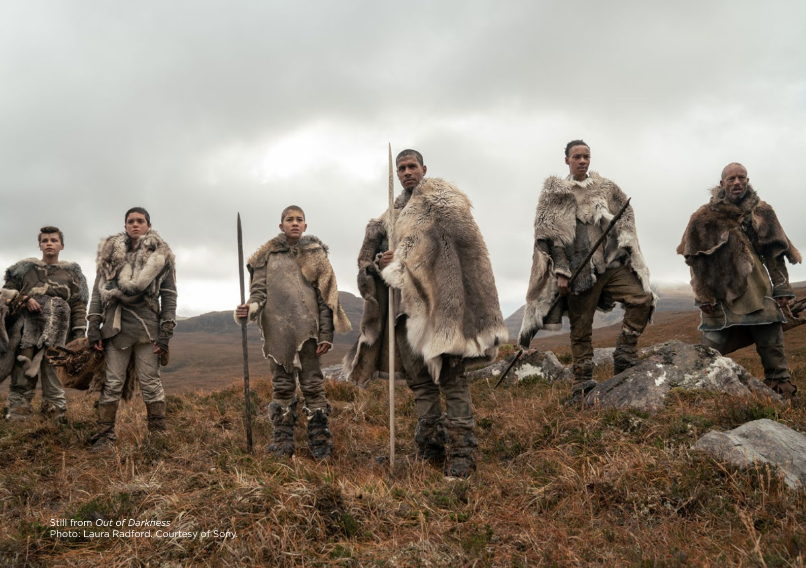
Still from Out of Darkness