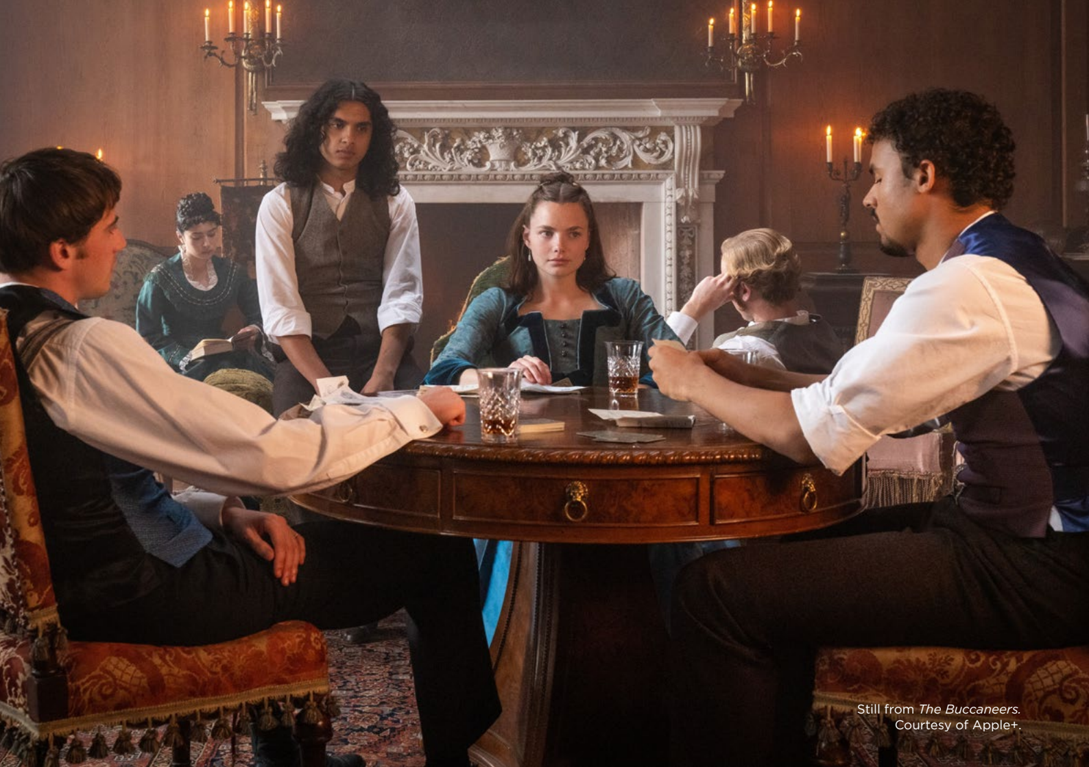
Still from The Buccaneers .